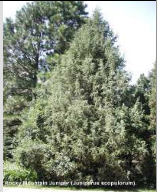
Rocky Mountain Juniper ( Juniperus scopulorum ).

**excerpted from North American Range Plants , Fifth Edition, Stubbendieck, Hatch, Butterfield**